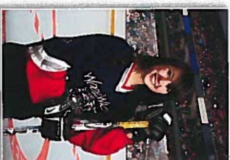
HOCKEY / RINGETTE SPORTS SPECIFIC BACKGROUNDS